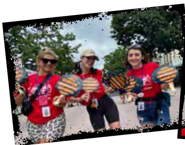
Musikfest Street Team

ASK ABOUT OTHER GREAT BRANDING OPPORTUNITIES INCLUDING: