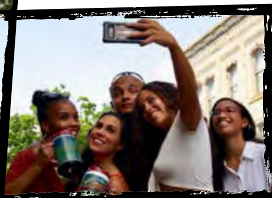
Social Media Upgrades